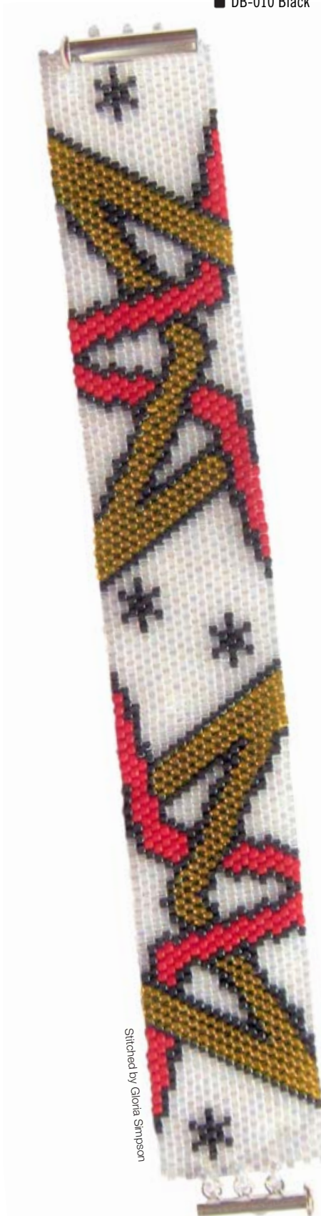
Stitched by Gloria Simpson

To submit a pattern, send us a hard copy. We pay for the patterns we post online. Write us at: Patterns, Bead&Button , P.O. Box 1612, Waukesha, WI 53187-1612